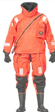
P_002 Seahorse SAR